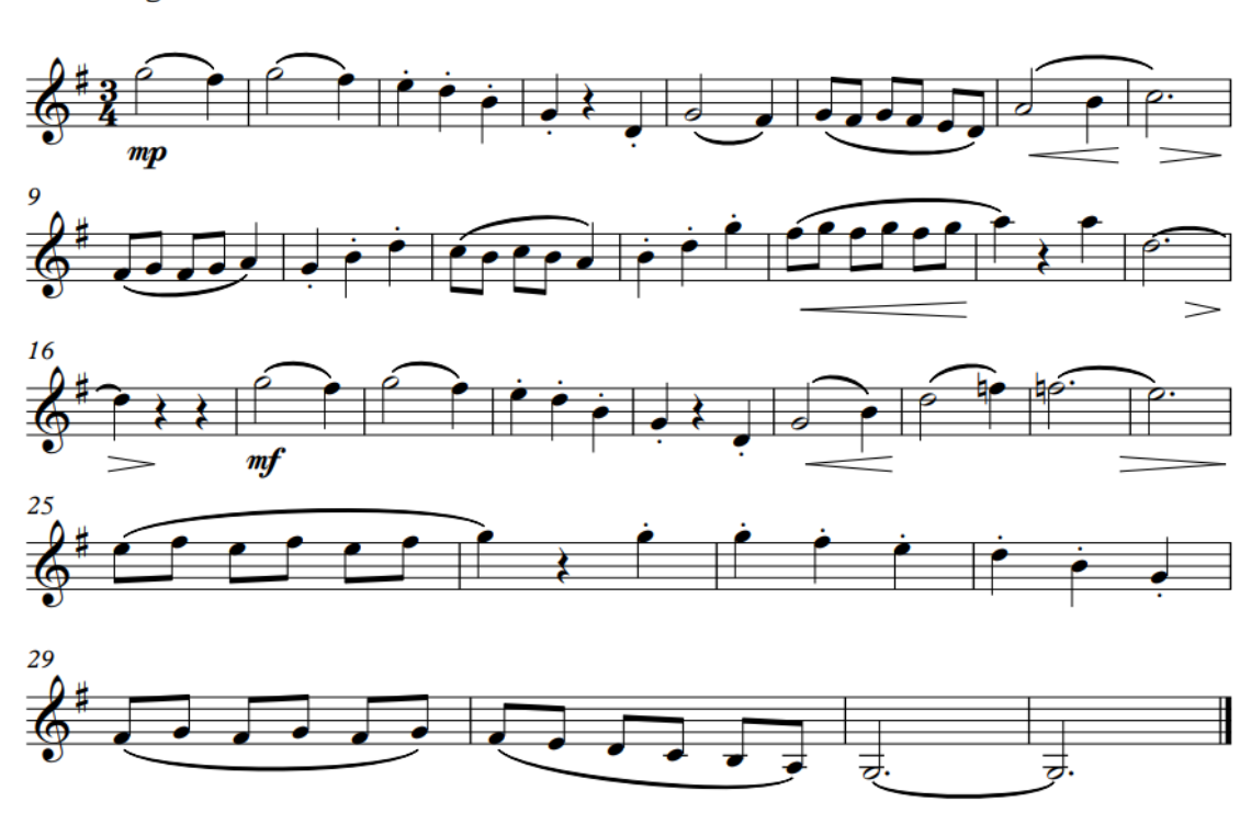
Allegro = 120